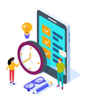
The biggest barrier to developing leaders? Time.

Not a new mistake, but the now-constant pressure of time makes it tempting to allow "natural selection" to take its course. However, the debate about leaders being born or made is over; leadership