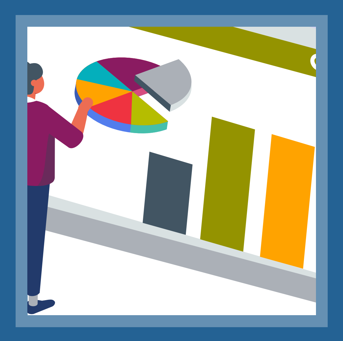
Leadership development practitioners enable leaders to be continuous learners.