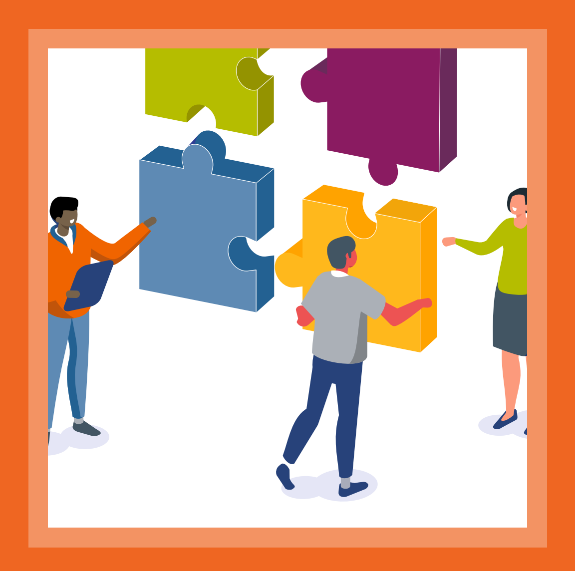
The goal isn't learning. It's performing.